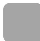
Aluminum RAL 9006

UV, marine environment, scratch resistant