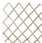
Flat Trendyrope White mix