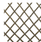
Flat Trendyrope Cocoa mix