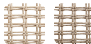
Oval Trendyrope Walnut mix