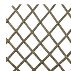
Flat Trendyrope Cocoa mix