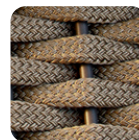
Nautic Rope Sand