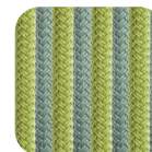
Round Trendy rope Grass-Turquoise