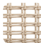
Oval Trendylope Walnut mix