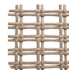
Oval Trendylope Caramel mix