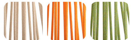
Oval Trendylope Walnut mix Oval Trendylope Orange mix Oval Trendylope Mint mix